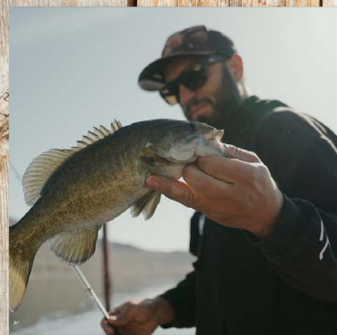
DAY OF FISHING