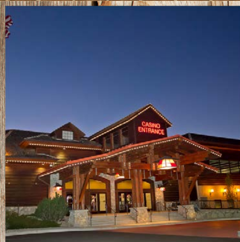
KATIES AT THE CVI

Head back to Gardnerville for lunch at JJ's Mexican Food, and to get your fish story straight.