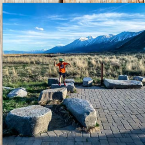
RIVER FORK RANCH TRAIL