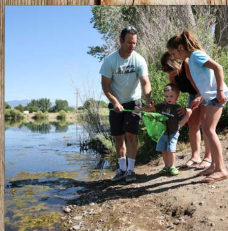
FISHING AT SEEMAN POND

There's no better way to end the day than with a scoop of ice cream at the Genoa Country Store!