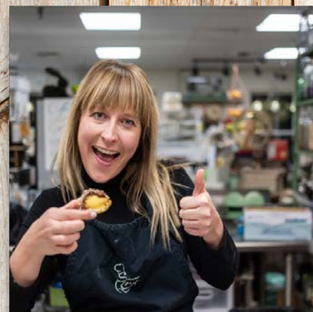
COOKING AT SIERRA CHEF