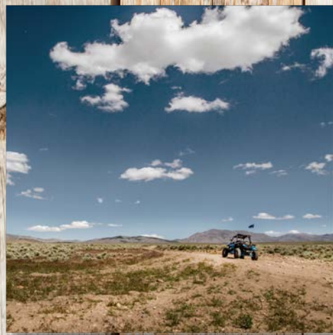
OFF ROAD FUN